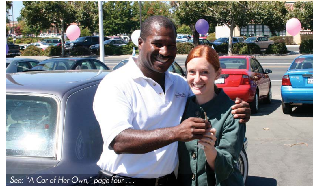
See: "A Car of Her Own," page four . . .